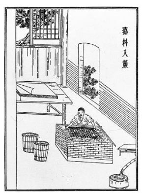
Early Chinese Papermaking

The earliest known paper has been traced back to 200 BCE in China. Archaeologists found a paper prayer embedded into the adobe brick of a home, presumably a blessing. In 105 CE, Ts'ai Lun, who worked for the Chinese emperor, announced and recorded the process of papermaking. Most early paper was used either for religious purposes, by the government, or the very wealthy for business transactions.