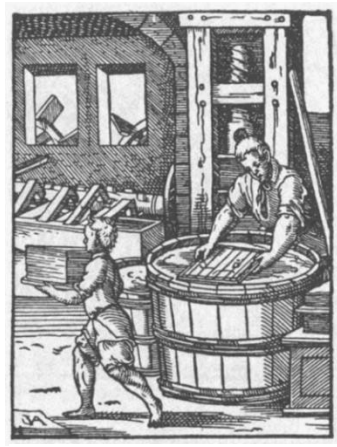
Early European Papermaking

and were unusable. The other 2/3rds were ready to beat into pulp. Sometimes the papermakers added lime to the rags to speed up fermentation, but this resulted in weaker paper.