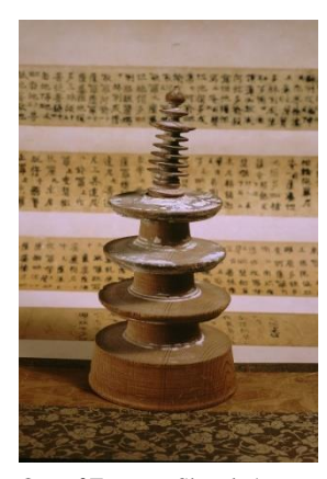
One of Empress Shotoku's Pagodas

The first papers were made from recycled fishing nets, bamboo, mulberry bark, or hemp. Papermakers followed several steps to make paper. First, the papermaker harvested the fibers. Large pits lined with stones or wooden vats were used to soak, or ret, the fibers for up to three months. The papermaker then pounded the fibers into pulp, likely using wooden tools or rocks. The papermaker poured a scoop of pulp on top of a mold and spread it out evenly by hand. Water drained through the screen, leaving the pulp behind. The molds with the wet paper were placed in the sunshine to dry. The dry paper was peeled off the mold, and the process repeated. An average papermaker probably owned 25 to 30 molds. The paper molds were a rectangular frame shaped from bamboo, and the interior portion was a loosely woven screen.