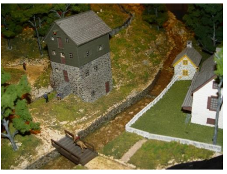
Rittenhouse Mill Model

Rittenhouse and his family made paper in the European method of papermaking. The three men working at the Rittenhouse Mill